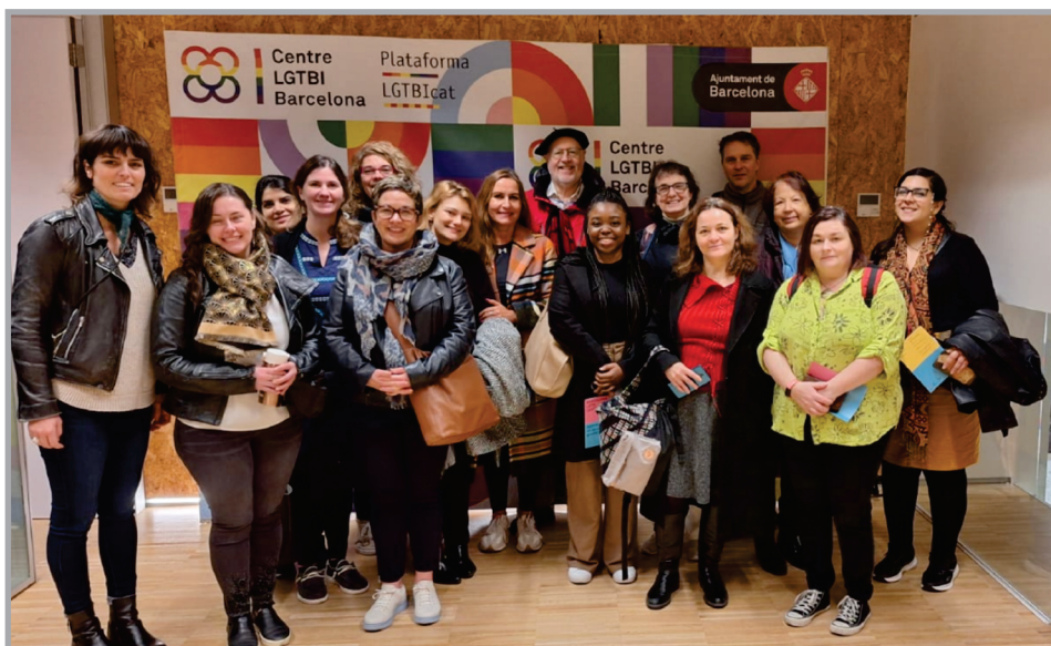
MTP Residency in Barcelona, February 2024

With the recent move towards regionalization of MTP, regional training centers have been created in Southeast Asia, Africa and Latin America that will be delivering MTPs in their respective regions. Similar regionalization efforts are also underway in North America and Europe.