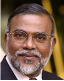
Dr Narendra Jadhav Member, Planning Commission Government of India

Dr. Narendra Jadhav is currently serving as a Member, Planning Commission (in the rank and status of Union Minister of State). As Member, Planning Commission, Dr. Jadhav's sectorial responsibilities include Education, Labour-Employment-Skill Development, Sports & Youth Affairs, and Social Justice and Empowerment. In addition, he looks after the States of Bihar, Tamil Nadu, and Goa, besides the Union Territories of Diu-Daman and Dadra-Nagar Haveli. He has also served as Vice Chancellor of University of Pune. In a period of less than three years, under his leadership, a metamorphic transformation of the University was brought about making it dynamic, vibrant, socially conscious and indeed, a Model State University, which is now also the most favored destinations for the foreign students coming to India.