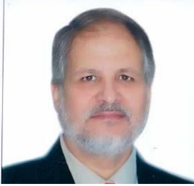
Prof Najeeb Jung Vice Chancellor, Jamia Millia Islamia

Prof. Najeeb Jung is the Vice-Chancellor of the Jamia Millia Islamia, a Central University in Delhi. He had joined the Indian Administrative Services (IAS) in 1973 and worked for 22 years in different capacities in Madhya Pradesh and with the Government of India including posts of District Magistrate, Managing Director of two Public Sector Companies and Jt. Secretary in the Government of India. He was Senior Advisor (Energy) for 7 years at the Asian Development Bank (ADB). He was also a Senior Visiting Fellow and Research Scholar at the Oxford Institute for Energy Studies, Oxford University for 7 years.