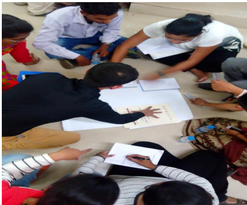
Pic 13: Group activity on PR methods

The students were seen as very actively participating in the activity, engaging with the task at hand, and most importantly, showed their keenness to learn new things, which could improve their research skills and abilities.