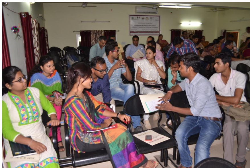
Pic 5: Students engaged in group discussions during the first technical session

Further to this, the students were given a short activity in the form of group discussions. They were divided into groups of 8-10, who were asked to discuss about their ' experiences in engaging with the community and the challenges which they faced '.