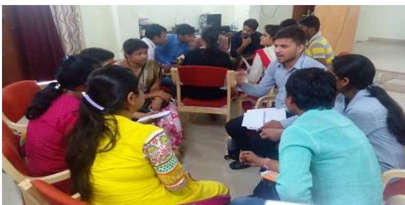
Pic 9: Group discussions on 'Difference between research topic & research question'