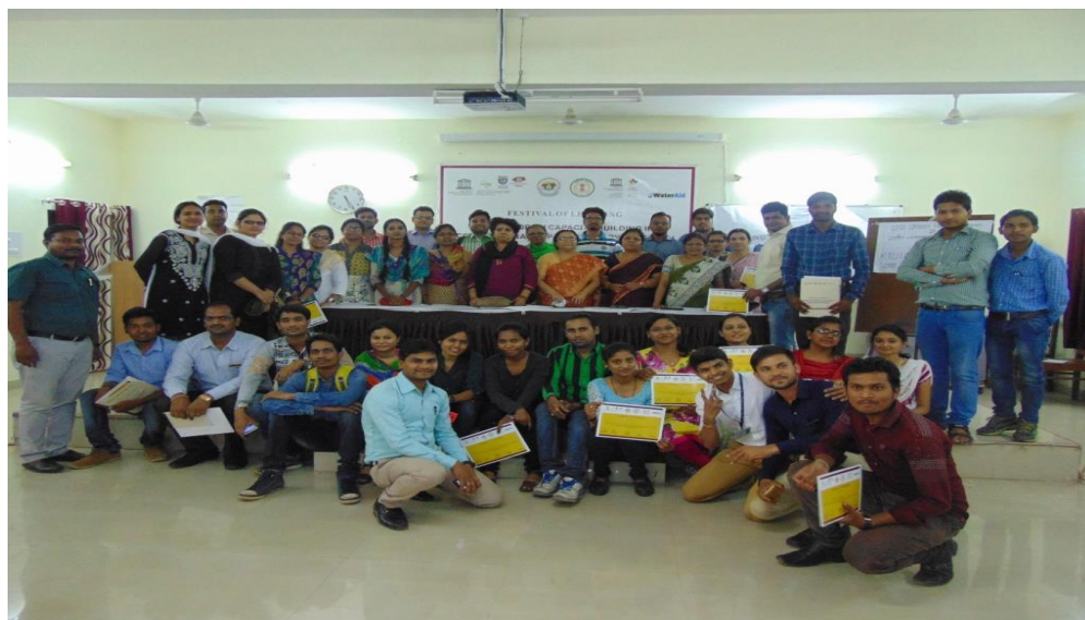
Pic 17: Group photograph of the workshop participants