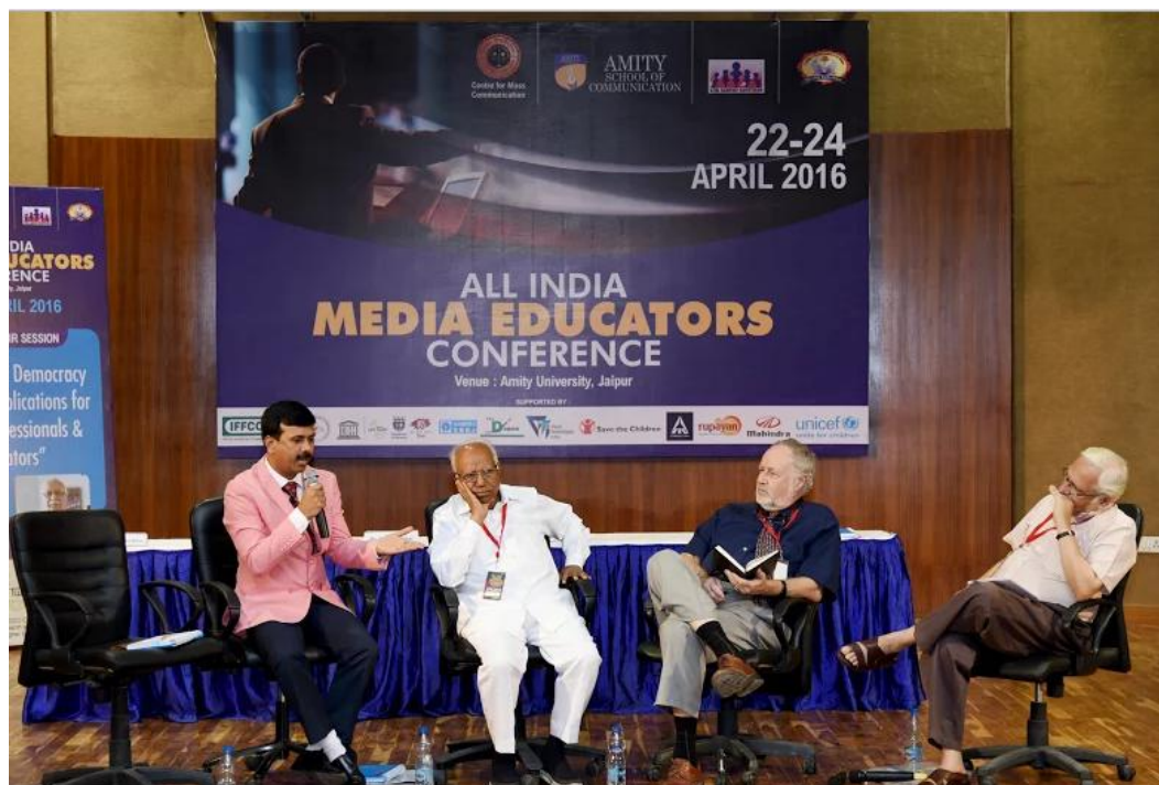
Pic 1: Panelists at the session on 'Knowledge, democracy and ethics: Implications for media professionals and educators'.