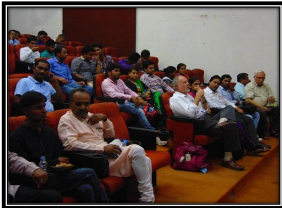
Pic 2: Audience at the seminar