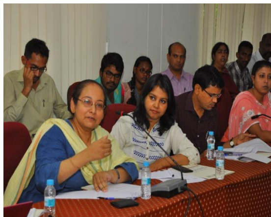
Pic 3 & 4: Open discussions