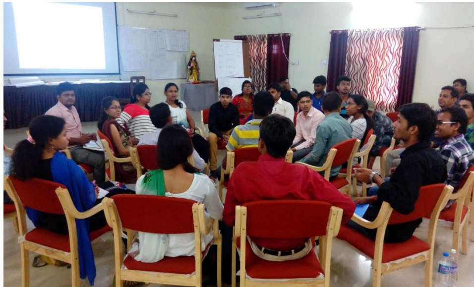
Pic 14: Students engaged in Focused Group Discussion