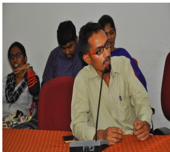
Pic 14 & 15: Open discussions