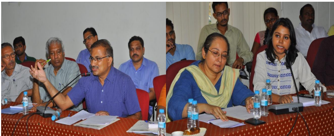
Pic 8 & 9: Open discussions